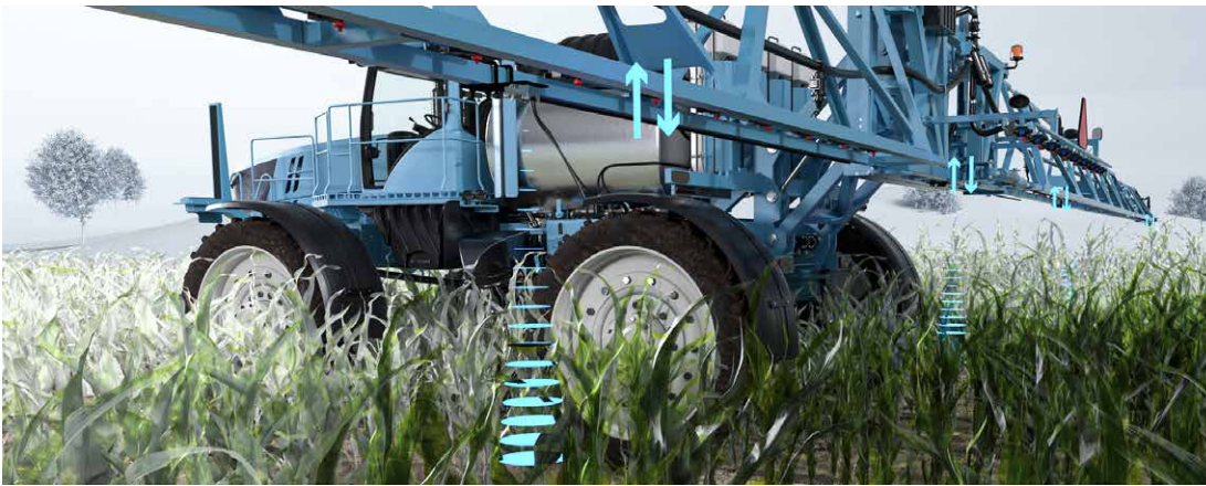
Figure 1: The R600V at work. On a sprayer it reliably detects the height of the crop as well as the distance to the ground hidden beneath it.

The Baumer radar sensor R600V simultaneously detects ground and crop distances and measures reliably on hot surfaces.